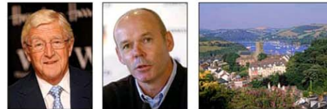
Resident knights: Michael Parkinson and Clive Woodward have Salcombe homes