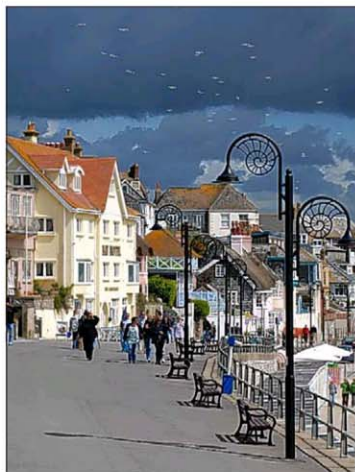
Refreshing Lyme: seafront at Lyme Regis, listed in the Top 10 most expensive seaside towns. Average price is £308,000