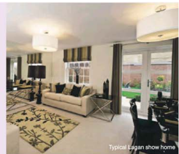
Typical Lagan show home

Visit www.lagan-homes.com to download your FREE Mortgage Protection Voucher