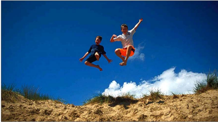
Big attraction: Camber Sands, near the port of Rye in East Sussex, has a fabulous Sahara-like Blue-Flag beach which attracts a surfing community

estate could be transformed into a magnificent seaside retreat. It is being sold either as a whole or as three plots, with planning permission for a trophy 6,500 sq ft residence to replace an existing house, a three-bedroom cottage and a studio in the fort. There is also permission to extend the boat house and jetty. The asking price is £4.5million. Call 01392 455740.