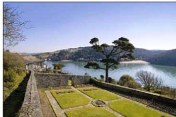
Coastal gem: the Old Vinery in South Hams, Devon, is a five-acre marine estate with its own Napoleonic fort on a private beach and foreshore. The asking price is £4.5million