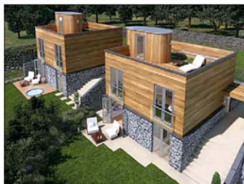
From £370,000: The Sky Deck, The Bay, Talland, between Looe and Polperro on Cornwall's south coast, where Knight Frank is offering holiday homes for sale. Call 01392 848844

N EXT time you find that you are dreaming about that little house by the coast, act fast – because you aren't the only dreamer and coastal homes are in hot demand.